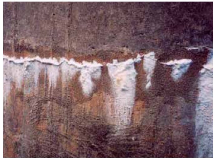
Autogenous healing at an advanced stage on a water retaining concrete structure.