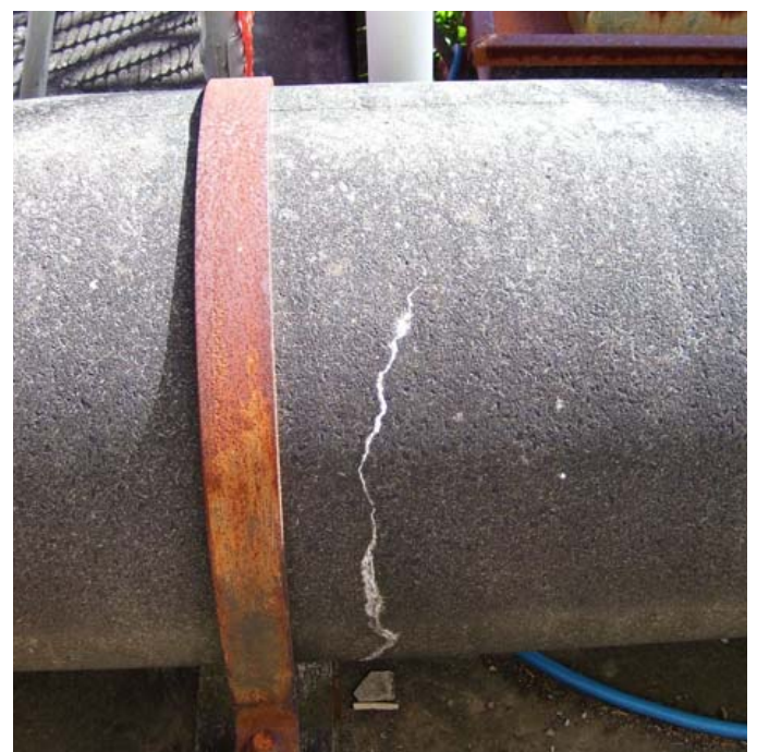
The white line signifies autogenous healing on this exposed concrete pipe

In a recent review, Adam Neville 3 summarises literature having a bearing on conditions necessary for autogenous healing of cracks. At an early age, continuing cement hydration in which calcium silicates in the cement are converted to calcium silicate hydrate can play a direct role in the healing process. In cracks healed at a later stage in the life of a structure, the main product which fills the crack is calcium carbonate, formed by combination of calcium from the hydrated cement with carbon dioxide dissolved in water from the atmosphere or other sources. Neither water hardness nor pH has been found to influence the process of autogenous healing. Various investigators have reported different maximum widths at which cracks have healed – “not surprising because the test conditions have varied widely. In some cases, the cracks were caused by shrinkage, in others by the application of tension, usually flexural but in some