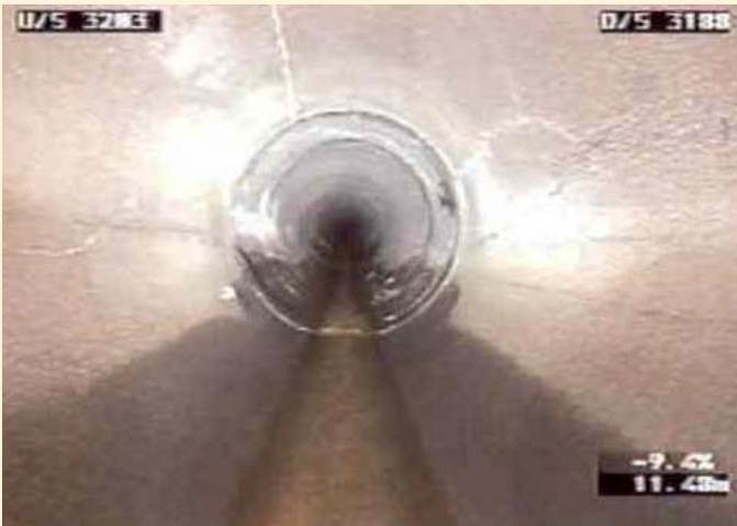
The white line signifies internal autogenous healing in this concrete pipe

tests by direct tension. The age at the opening of cracks varied too. The healing took place in static water or flowing water, whether there was a head of water or not. The water was fresh or seawater.”